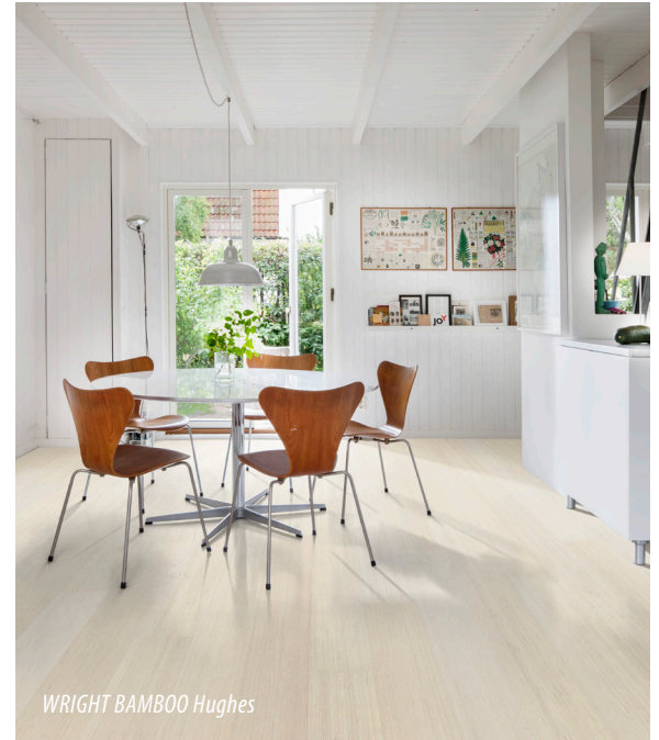
WRIGHT BAMBOO Hughes