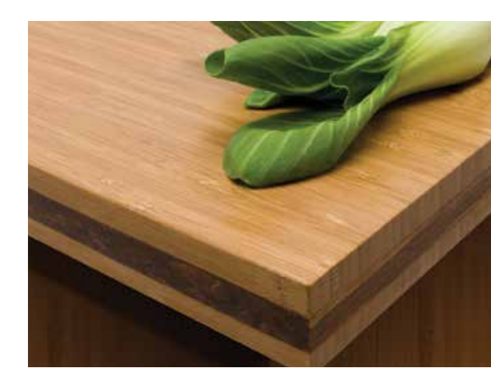
Vertical Grain Caramelized face with Chestnut strand core