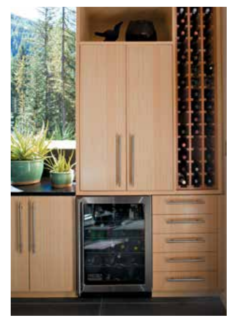
4' x 8' x ¾" panels, Vertical Grain Natural