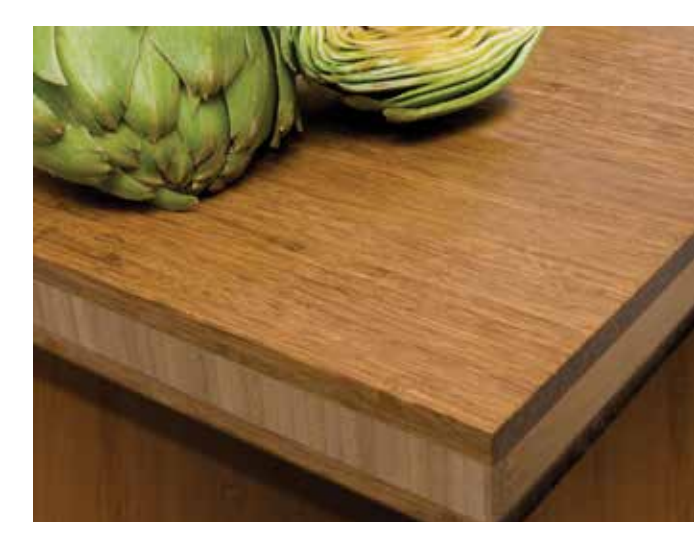
Chestnut strand face with Vertical Grain Caramelized core