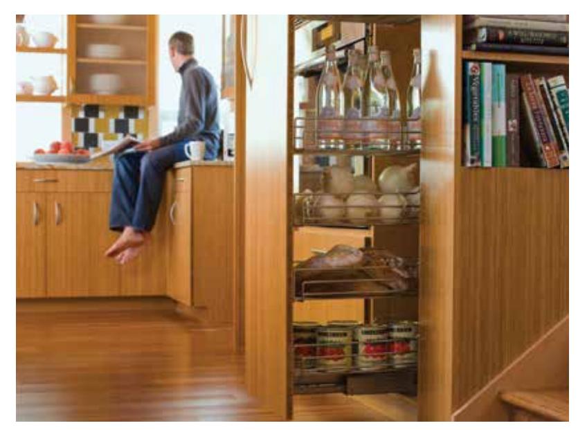
4' x 8' x ¾" cross-ply panels, Vertical Grain Caramelized Synergy™ strand bamboo flooring, Java