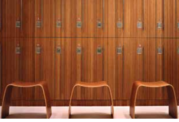
4' x 8' x <sup>1</sup>/<sub>42</sub>" Veneer, Vertical Grain Caramelized