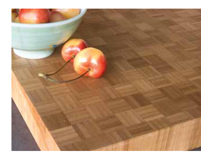
Bamboo parquet butcher block, Caramelized